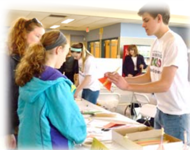
Middle School Activity Room

The Lower Hudson Valley Engineering Expo, a project of The Foundation for Engineering Education, Inc. (FEE). FEE is a NYS Chartered 501(c)(3) corporation. Donations are tax deductible to the maximum extent allowed by law. A copy of the latest annual report may be obtained, upon request, from The Foundation for Engineering Education, Inc., 385 Jordan Rd, Suite 6, Troy, NY 12180 or from the New York State Attorney General's Charities Bureau, Attn: FOIL Officer, 120 Broadway, New York, NY 10271