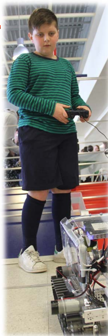
Robots, Computer Challenges, Interactive demonstrations and MORE!